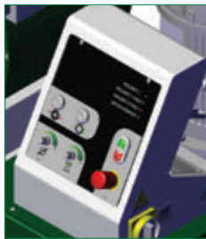
◀ ES3 ELECTRONIC CONTROL WITH TOUCH SCREEN