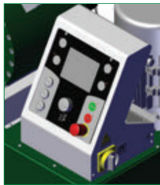
◀ ES3 ELECTRONIC CONTROL WITH TOUCH SCREEN